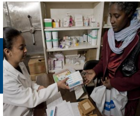
Pharmacy in Addis Ababa, Ethiopia dispensing medication to patient.

Axios' patient-focused supply chain management approach has been used effectively in more than 100 countries, benefitting more than 8 million patients and counting.